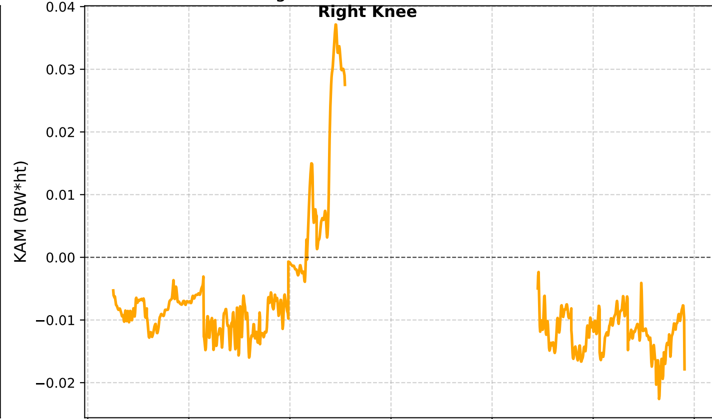
Right Knee Adduction Moment