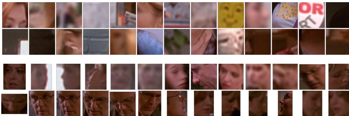
Figure 2. Excerpt of false positives (two top rows) and misses (two bottom rows) of our approach on the Buffy dataset.

multiple frames tend to be hard to prune in the tracking stage. Misses are either dark, blurry, highly non-frontal or tilted faces. The latter can be overcome by using additional face detectors trained for tilted angles.