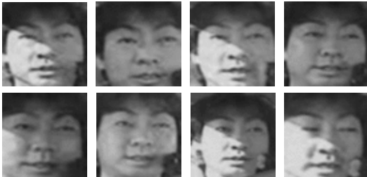
Figure 3. Sample cropped face images

Most of the images have been automatically extracted from the video stream with a Haar features-based face detector [15] using OpenCV library [16]. Sample automatically cropped face images can be seen in Figure 3. On parts of the videos where this procedure failed (due to occlusion by the steering wheel or the driver’s hand, for example), faces have been selected manually. The cropped faces are then scaled to 64x64 pixels resolution. In local appearance face recognition, five DCT coefficients are used to represent each local region. To provide a baseline system PCA/eigenfaces algorithm is also implemented [5]. In PCA approach, first 20 eigenvectors are used to represent the face images.