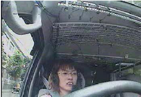
Figure 2. A sample image from the recording.

The experimental data set consists of a subset of CIAIR-HCC database, an in-vehicle data corpus that is collected at the Nagoya University, Japan [14]. It contains image sequences of ten male and ten female subjects while they are driving. Each person has twenty image sequences and each of these image sequences contains 25 frames. The sequences are extracted from all available video data, in a sparsely sampled manner. The recordings are done with a camera, that is mounted in the front left part of the car facing the driver. A sample shot from the camera is shown in Figure 2.